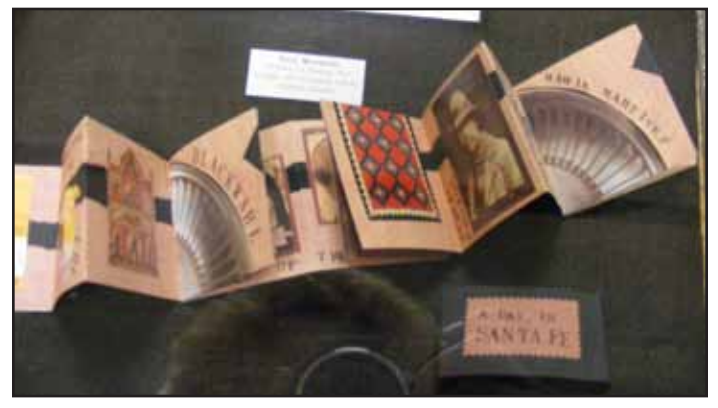
Geri M: A Day in Santa Fe, accordion with collage