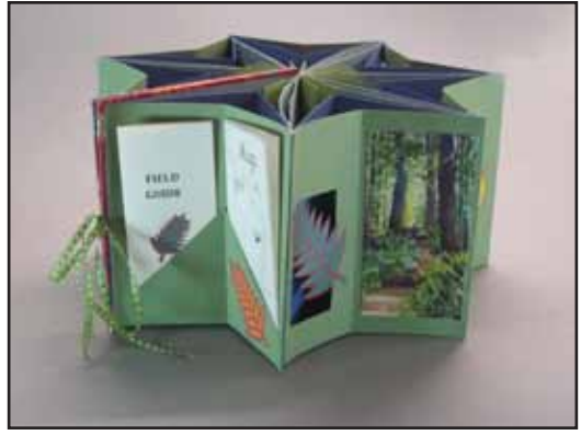
Margy O: A Woodland Walk, star book