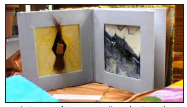
Beverly W: Layers of New Mexico, collograph prints and found objects in frame pages