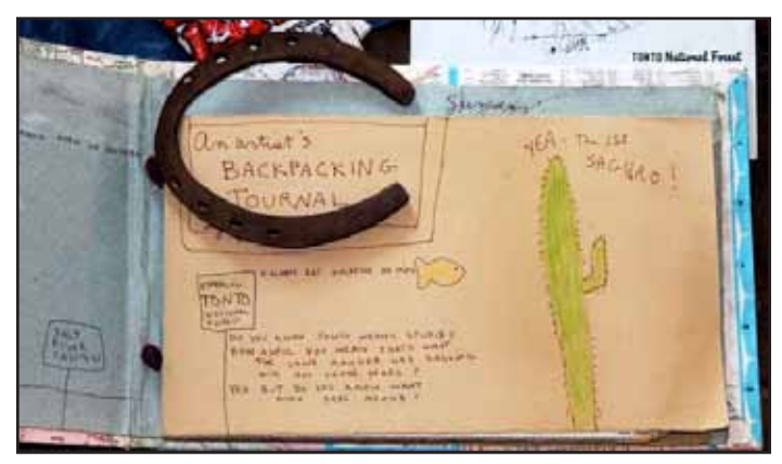
Judith R: An Artist's Backpacking Journal, multimedia