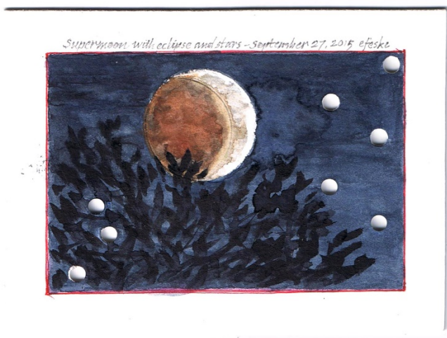
Esther Feske, "Supermoon"